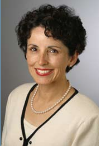
France A. Córdova

During my first year as Purdue's president, I have been impressed by successful efforts of Purdue's Technical Assistance Program, which have clearly been a boon to our state and its economy. TAP is remarkable in its ability to impact the businesses, institutions, and people of Indiana. It is truly a vehicle to "advance Indiana's economic prosperity and quality of life" — and, thus, positively impacts thousands of Hoosiers from Fort Wayne to Terre Haute.